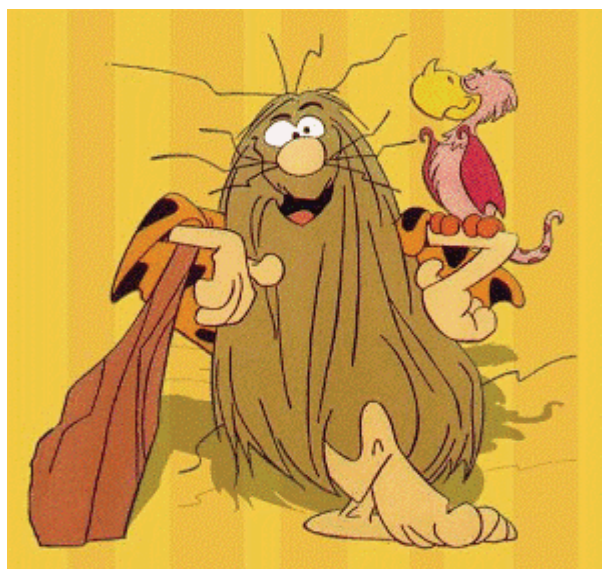
Name this TV Cartoon Superhero from 1977

We're always looking for new cavers, you know. Don't seem to be getting too many for some reason. 🐾