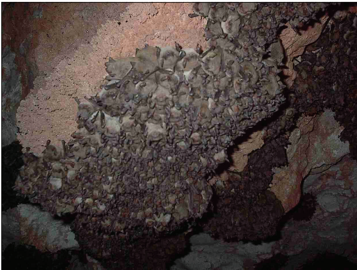
Our Bat Friends up Close. Taken during the NW 2009 Bat Count